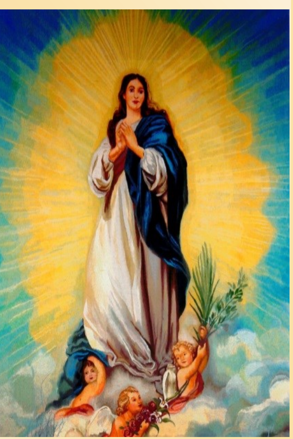
Our Vision: To be a community of God's Love and Service