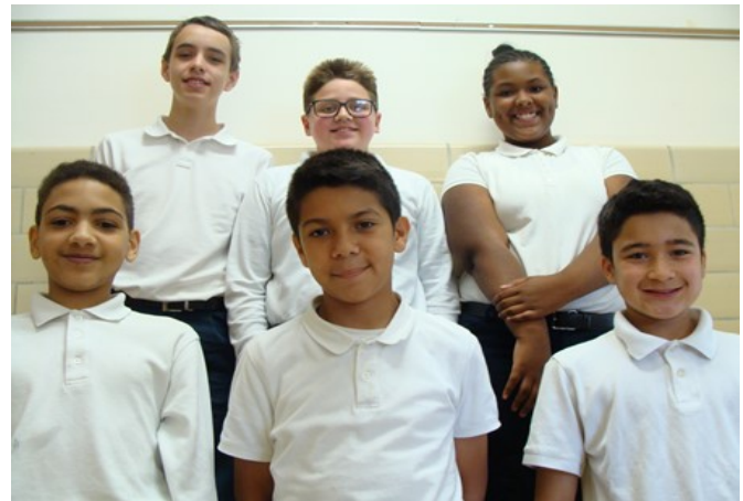
The ICS Class of 2017

We wish our graduates luck as they enter our area's middle schools and pursue their hopes and dreams these next few years.