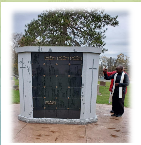
Fr. Augustine Chumo and Deacon George Kozak (hidden in red) bless the Columbarium on All Souls Day 2023.

Cremation burials are becoming more popular in our cemetery. The Catholic Church frowned upon cremation until 1963 when the Vatican allowed it as long as there was recognition of the sacredness of the body and did not conflict with teachings about the Resurrection. This change was incorporated into Canon Law in 1983 and in 2016 the Vatican issued instructions regarding burial of the deceased and the conservation of ashes and cremated bodies. According to these instructions, the deceased ashes are to be treated with respect and laid to rest in a consecrated place, never to be scattered, divided or kept in a private residence.