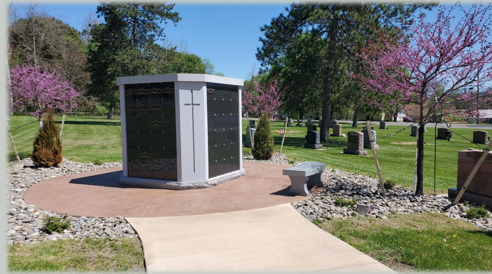
Pictured: Calvary Columbarium & Cremation Garden, Spring 2024