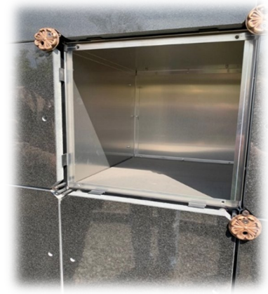
Pictured: Interior of a single niche (holds two urns of cremains. Each niche is airtight and secured to prevent water and pests from entering with a secure black shutter (not shown) before the bronze plaque is affixed to the outside.